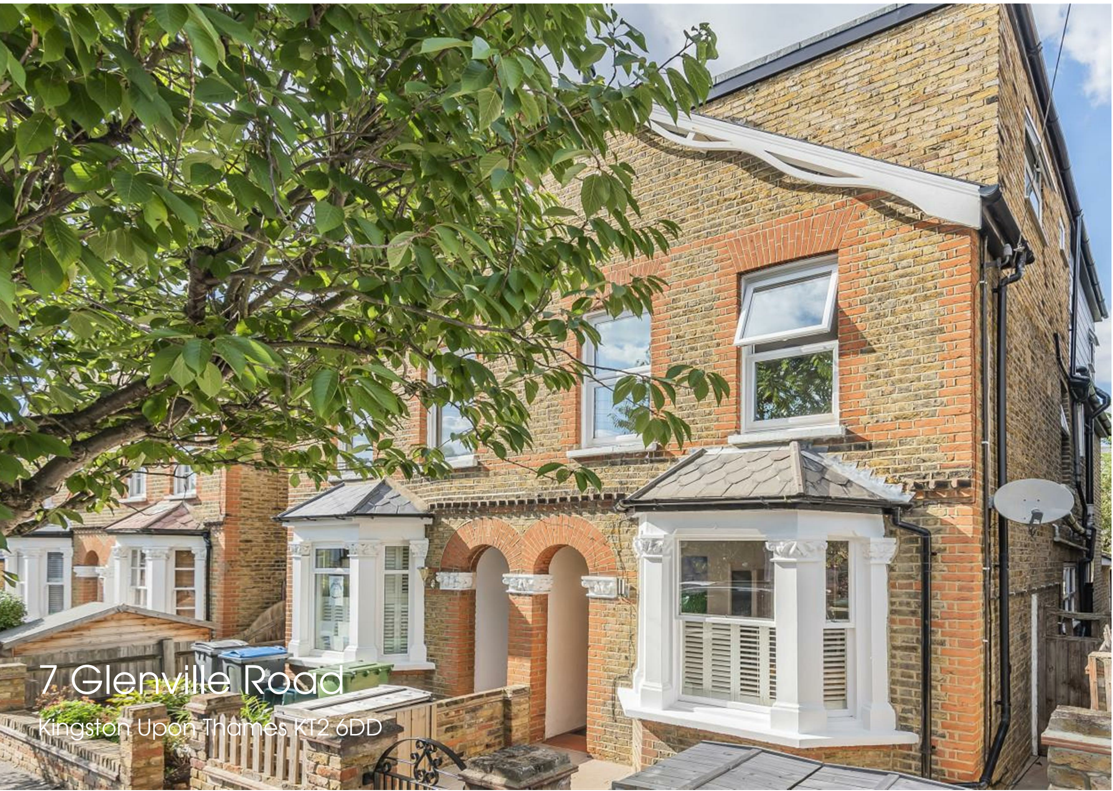
7 Glenville Road Kingston Upon Thames KT2 6DD